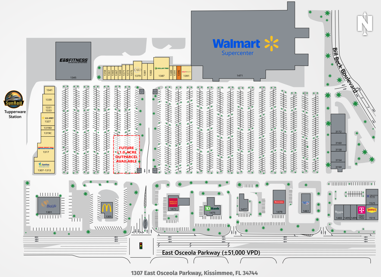
1307 East Osceola Parkway, Kissimmee, FL 34744