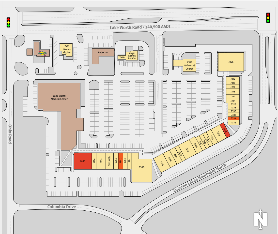
7300-7478 Lake Worth Road, Lake Worth, Florida 33467