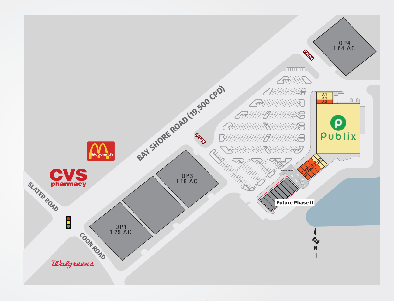
6700 Bayshore Road, North Fort Myers, FL 33917

This Center is located in North Fort Myers approximately 3 miles west of I-75 on Bayshore Road at Coon Road. There are four (4) out-parcels available along with Phase II land. The Enclaves, a 200 home, single family development is under construction directly to the south of the center. The center provides ample parking, multiple access points and prominent pylon signage.