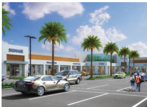
Conceptual rendering. Subject to final approvals.