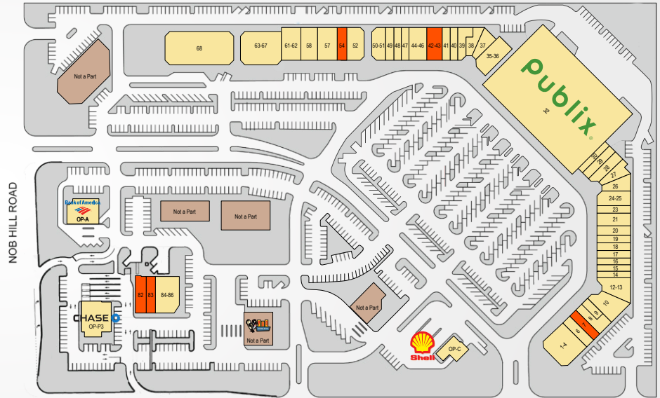
10065 Cleary Boulevard, Plantation, FL 33324