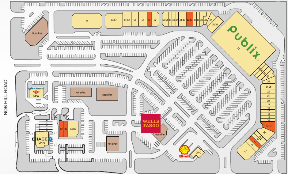
10065 Cleary Boulevard, Plantation, FL 33324