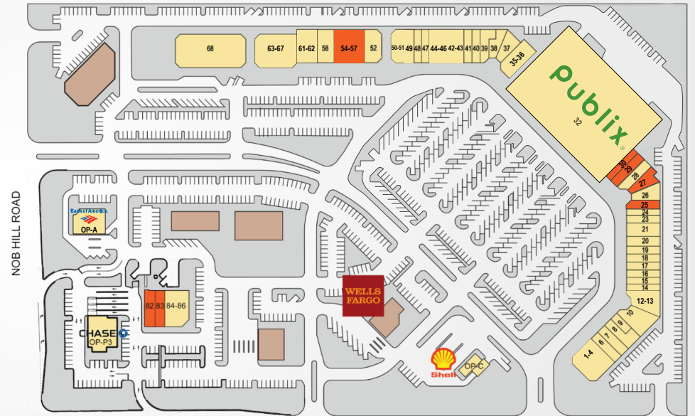
10065 Cleary Boulevard, Plantation, FL 33324