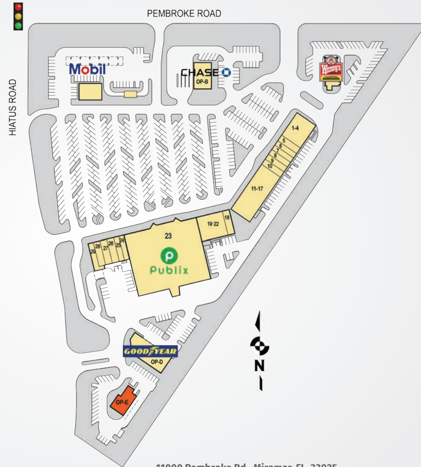
11000 Pembroke Rd., Miramar, FL 33025

Miramar Commons is located on the SW corner of Pembroke Rd and Hiatus Rd. This Publix-anchored center services the densely populated area of Miramar. With a combined traffic count of over 64,000 vehicles per day, the center offers convenient ingress and egress to commuters and residents alike. A new 80,000 sq ft office complex is currently under construction directly across the street, which when complete, will even further expand the center's regular customer base.