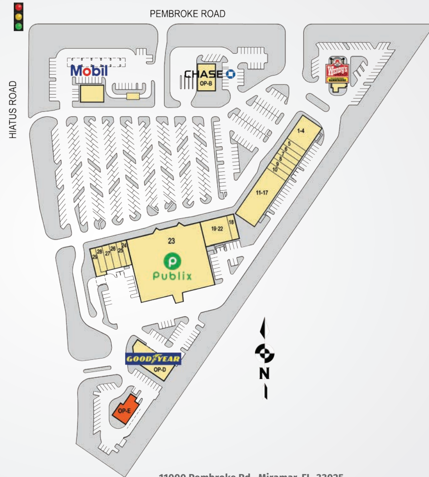
11000 Pembroke Rd., Miramar, FL 33025

Located on the SW corner of Pembroke Rd. and Hiatus Rd., Miramar Commons is centrally situated in the densely populated city of Miramar. Tenants at Miramar Commons benefit from a strong daytime population as well as the large residential population which source the center with customers throughout the entire day. The center is anchored by a high-volume Publix Supermarket and is home to other notable quality tenants including a South Broward Community Health Center, Chase Bank, Metro PCS and Pacesetter Academy Learning Center.